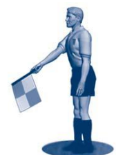
Offside on the near side of the field