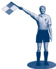
Throw-in for attacker