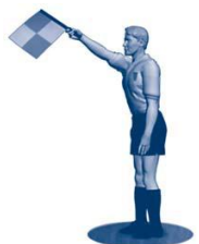
Offside on the far side of the field