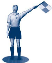
Throw-in for defender